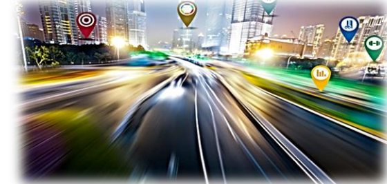
Global Digital Commerce Market $25bn