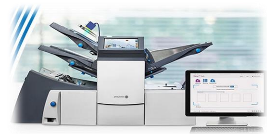
Global SMB Market $3-$4bn

The Digital Commerce Solutions group includes the Software Solutions and Global Ecommerce segments. Software Solutions provide customer engagement, customer information and location intelligence software. Global Ecommerce facilitates global cross-border ecommerce transactions and domestic retail and ecommerce shipping solutions.