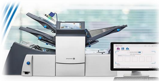
Global SMB Market $3-$4bn

The Digital Commerce Solutions group includes the Software Solutions and Global Ecommerce segments. Software Solutions provide customer engagement, customer information and location intelligence software. Global Ecommerce facilitates global cross-border ecommerce transactions and domestic retail and ecommerce shipping solutions.