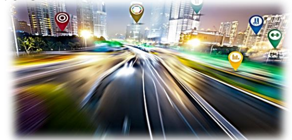
Global Digital Commerce Market $25bn