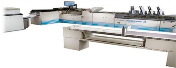
Global Enterprise Market $5bn